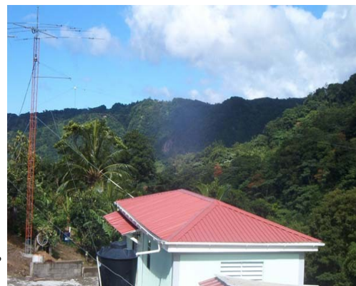
Hetty's Cottage in Dominica