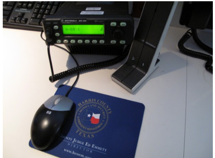
The HCOHSEM Emergency Operations Center