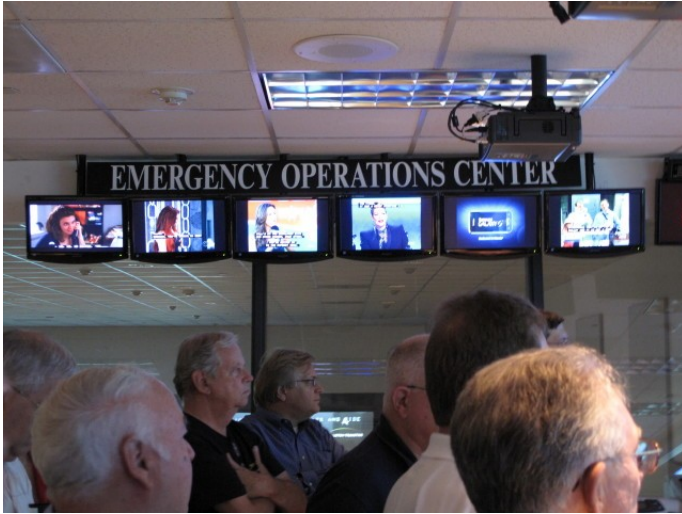
In the EOC