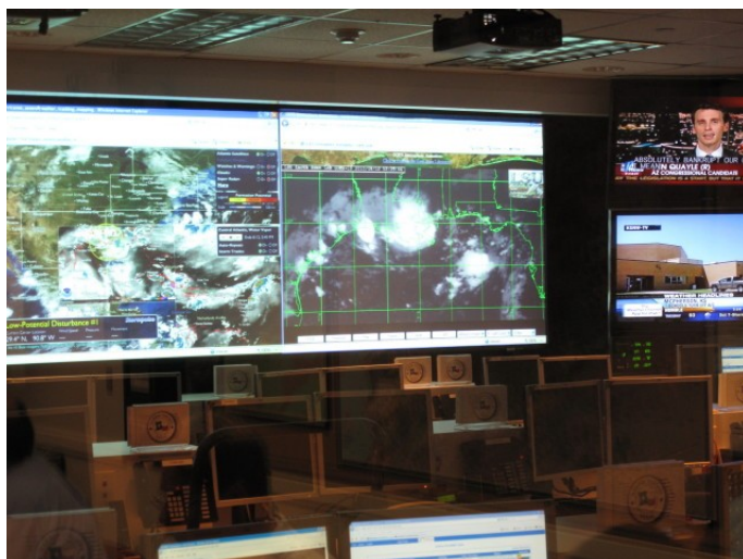
The HCOHSEM Emergency Operations Center