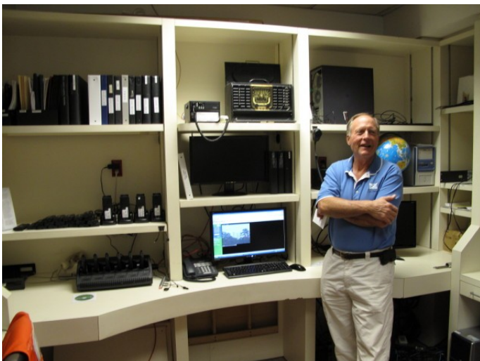
In the HCOHSEM Emergency Operations Center ham shack