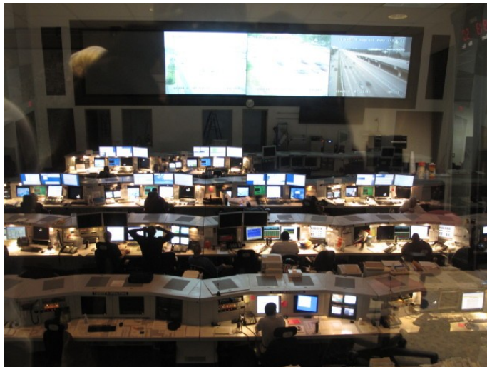
The TranStar operations room